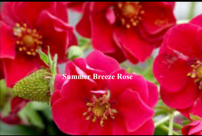
Summer Breeze Rose