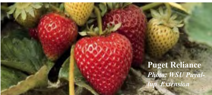
Puget Reliance

“Seascape” (U.S. PP 7,614) - Moderate vigor, good durability, susceptible to verticillium wilt. Large, bright red external color, pale internal color, poor capping, firm, good flavor. Low to medium yield. Fresh eating. Good for small farm or home garden.