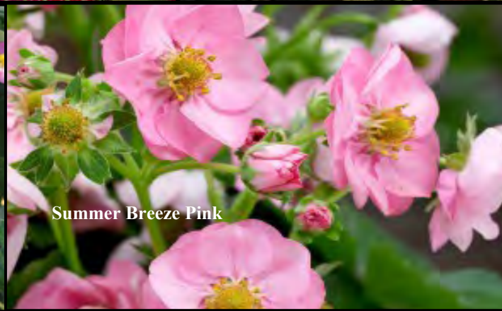
Summer Breeze Pink