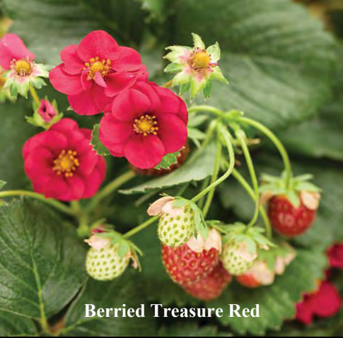
Berried Treasure Red