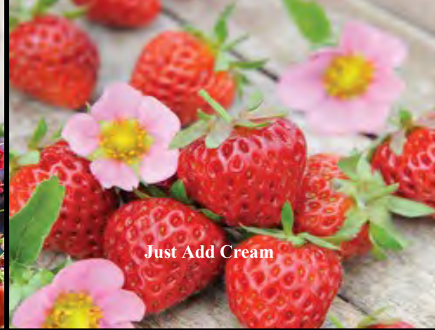
Just Add Cream